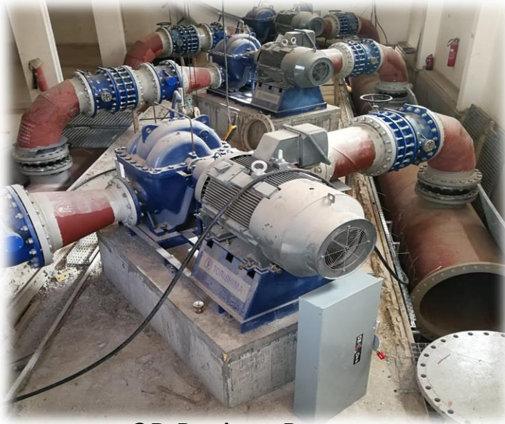
3B Project Pumps