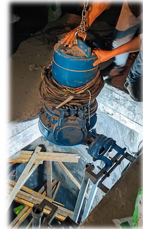
Marina Project Pumps