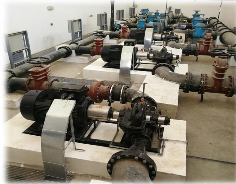
Taif Project Pumps